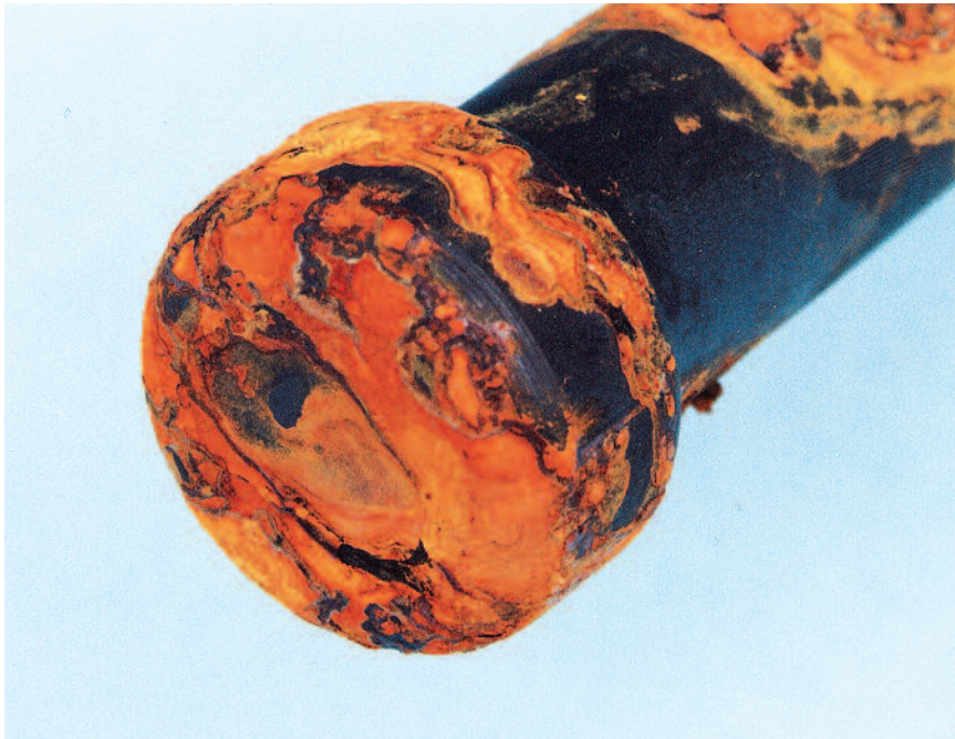
Corroded end tube and tip on competitive sample after 27-hour salt fog exposure.