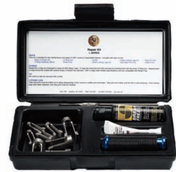
Maintenance Kits are available to service your Agent Baton.