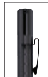
Snap-Loc™ clips are removable.

Retract your Agent Baton by stabilizing the end tube. Rotate the middle tube clockwise while pressing the end tube inward. Then stabilize the middle tube. Rotate the handle while pressing the middle tube inward.