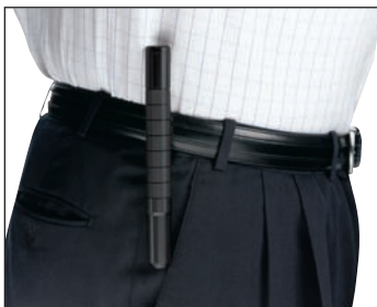
Carry your Agent™ Baton in your pocket, on a dress belt or inside your waistband.