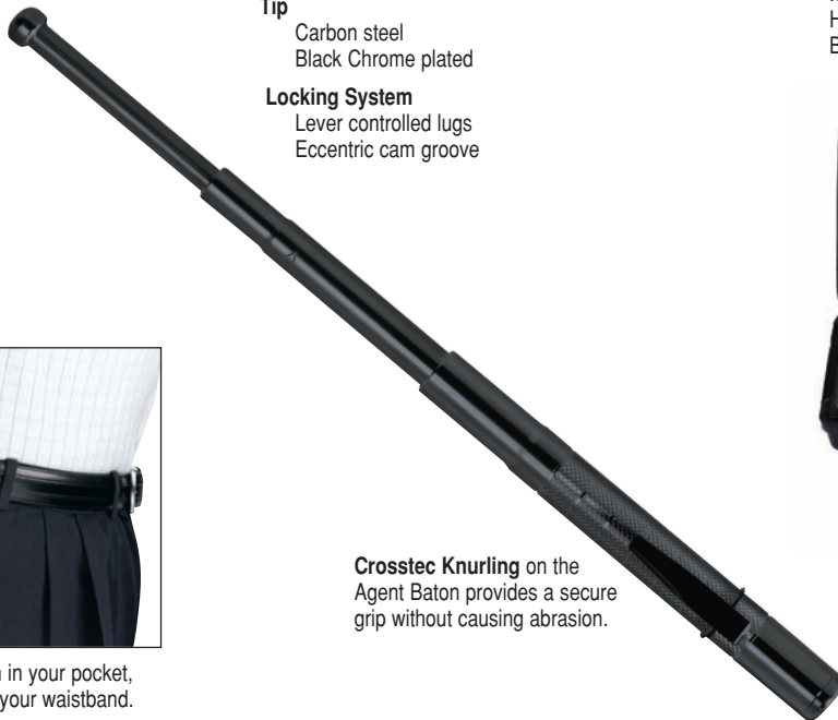
Crosstec Knurling on the Agent Baton provides a secure grip without causing abrasion.

.040 thick Heat treated spring steel Black Chrome plated