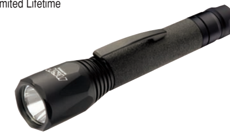
Triad® AA, CR and USB LED lights use the same TLC Tactical